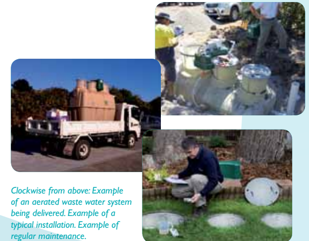
Clockwise from above: Example of an aerated waste water system being delivered. Example of a typical installation. Example of regular maintenance.